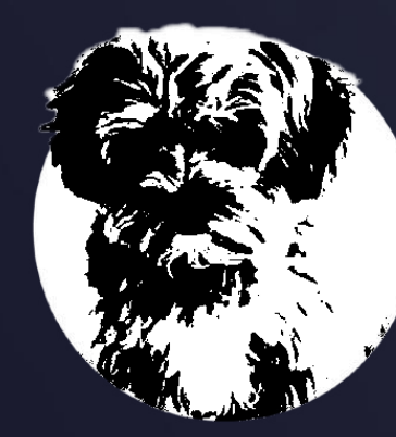
Martin Team Builder